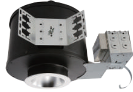
DLED-9540 [Non-IC Rated]